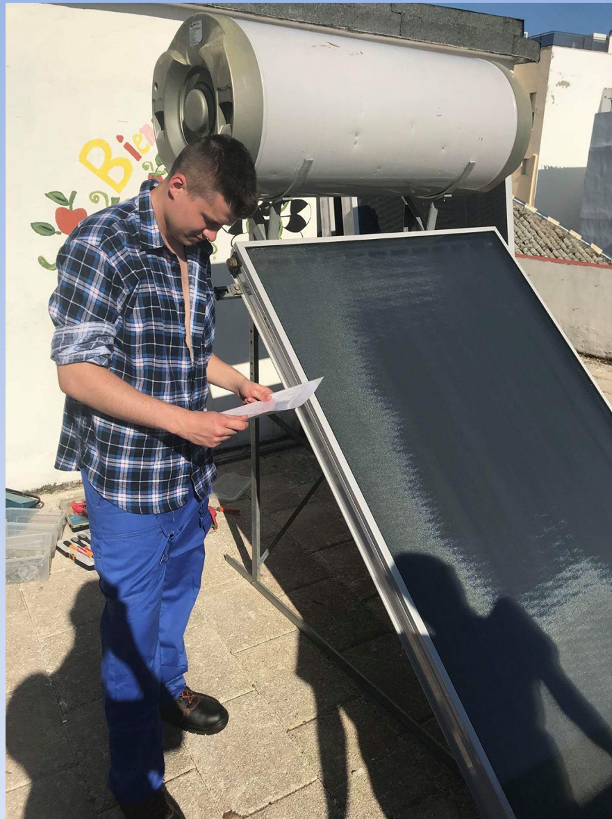
It's me while work, the temperature was very high